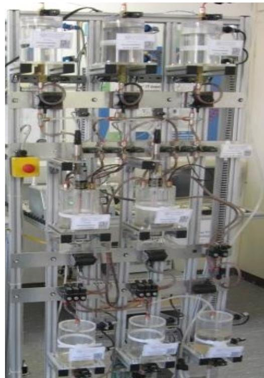
Figure 1: Multi product and multi train-multi path process cell at TU Dresden as playground for modern process control engineering

The core of the plant consists of 2 reactors that are loaded with different educts. In the reactors, different products can be made at the same time. For that reason, the plant can be classified as multi-product plant and multi train-multi path plant . It consists of several units that are permanently connected to each other. Depending on the production process, it is possible to wire the lines between the units dynamically. This requires complex automation. In the following chapters of this training module we will learn, however, that by taking into account a few simple principles and rules, the complicated automation system can be assembled quite effectively and efficiently by combining existing blocks of the PCS 7 process control system.