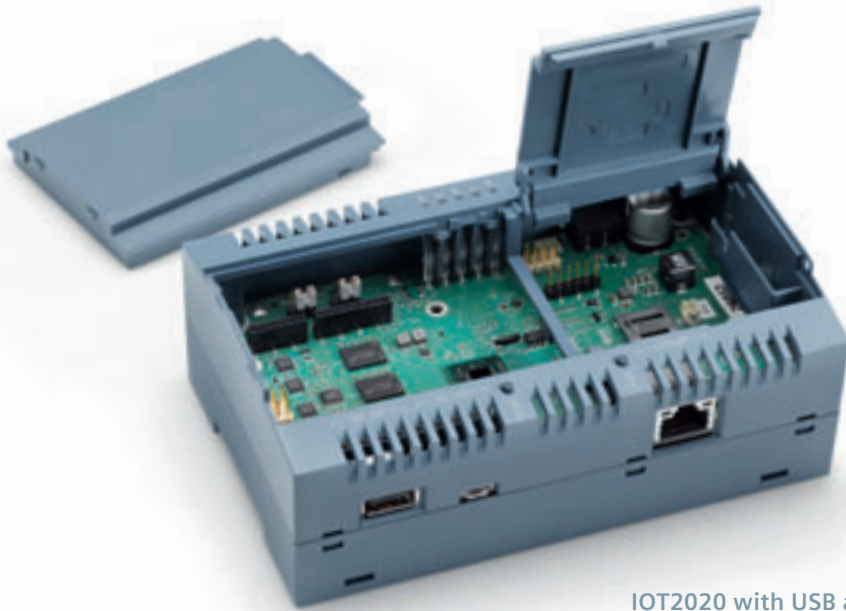
IOT200 with USB and Ethernet interface