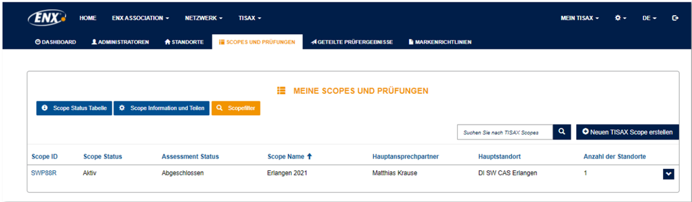
Figure 1: TISAX Scope