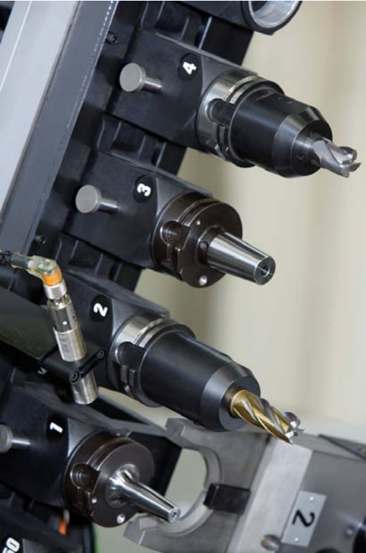
The sonar proximity switch checks whether the place in the tool changer is really free before reinserting the tool.