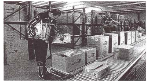
Picture 1: The ordered articles are carefully put together and packaged (Ill: Siemens AG)

With IQ-Sense, sensors are seamlessly integrated into the control environment. The special IQ-Sense optical sensors are connected with the IQ-Sense electronics