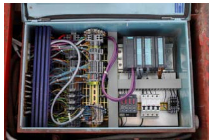
Fig. 2: Communication with the stabilizers of the ladder truck is achieved through a decentralized I/O station

safety PLC via an industrial communication bus (PROFIBUS DP). There is a touch panel in the cab for visually managing positions and movements (Fig. 2). In practical terms the PLC guarantees the stability of the ladder truck irrespective of the physical location of the stabilizers. The turning mechanism as well as ladder and safety basket movements are controlled by using joysticks which are linked to the PLC, which in turn determines maximum maneuverability. The PLC then controls the valve modules for the actual movements.