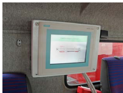
Fig. 3: Positions and movements can visually be managed with the touch panel

Siemens AG Industry Sector Industry Automation & Drive Technologies P.O. Box 4848 90026 Nuremberg GERMANY