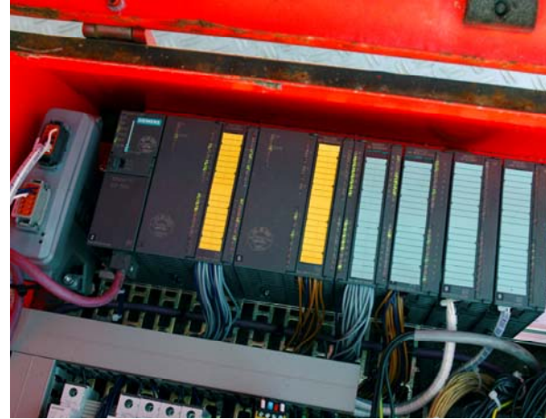
Fig 1: All movements of the ladder truck are being controlled by the PLC

safety PLC via an industrial communication bus (PROFIBUS DP). There is a touch panel in the cab for visually managing positions and movements (Fig. 2). In practical terms the PLC guarantees the stability of the ladder truck irrespective of the physical location of the stabilizers. The turning mechanism as well as ladder and safety basket movements are controlled by using joysticks which are linked to the PLC, which in turn determines maximum maneuverability. The PLC then controls the valve modules for the actual movements.