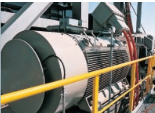
Rugged H-Compact high-voltage motors also play their role in achieving a high reliability of the complete system.