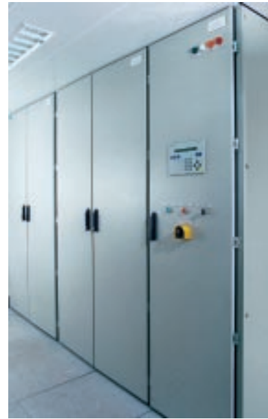
SIMOVERT MV is the first medium-voltage drive converter equipped with HV-IGBT power semiconductors. When required, it can be equipped with an Active Front End, for example if braking energy is to be fed back into the line supply.