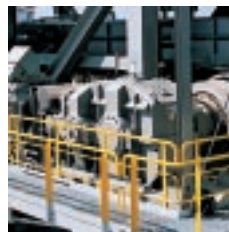
Using the harmonized motor/drive converter systems, the speed of conveyor belt drive stations can be controlled therefore increasing their efficiency.